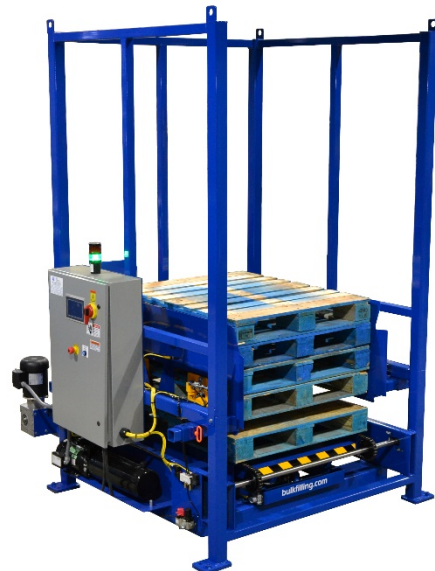
Figure 5 – PalletMAX™ Pallet Dispenser