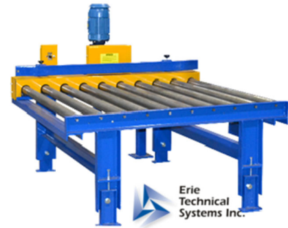
Figure 1 – Chain Driven Live Roller Conveyor from Erie Technical Systems Inc.

Note that these are the standard and most common ranges. Custom sizes and designs are available.