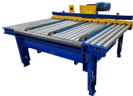
Figure 4 - PUCT Conveyor

Erie Technical Systems Inc. also manufactures Pop-Up Chain Transfer Conveyors (PUCT) and pallet dispensers to complement our CDLR conveyors shown here. Pop-Up Chain Transfer conveyors allow pallets and totes to be transferred at 90 degrees. Visit our website for additional details – www.bulkfilling.com .